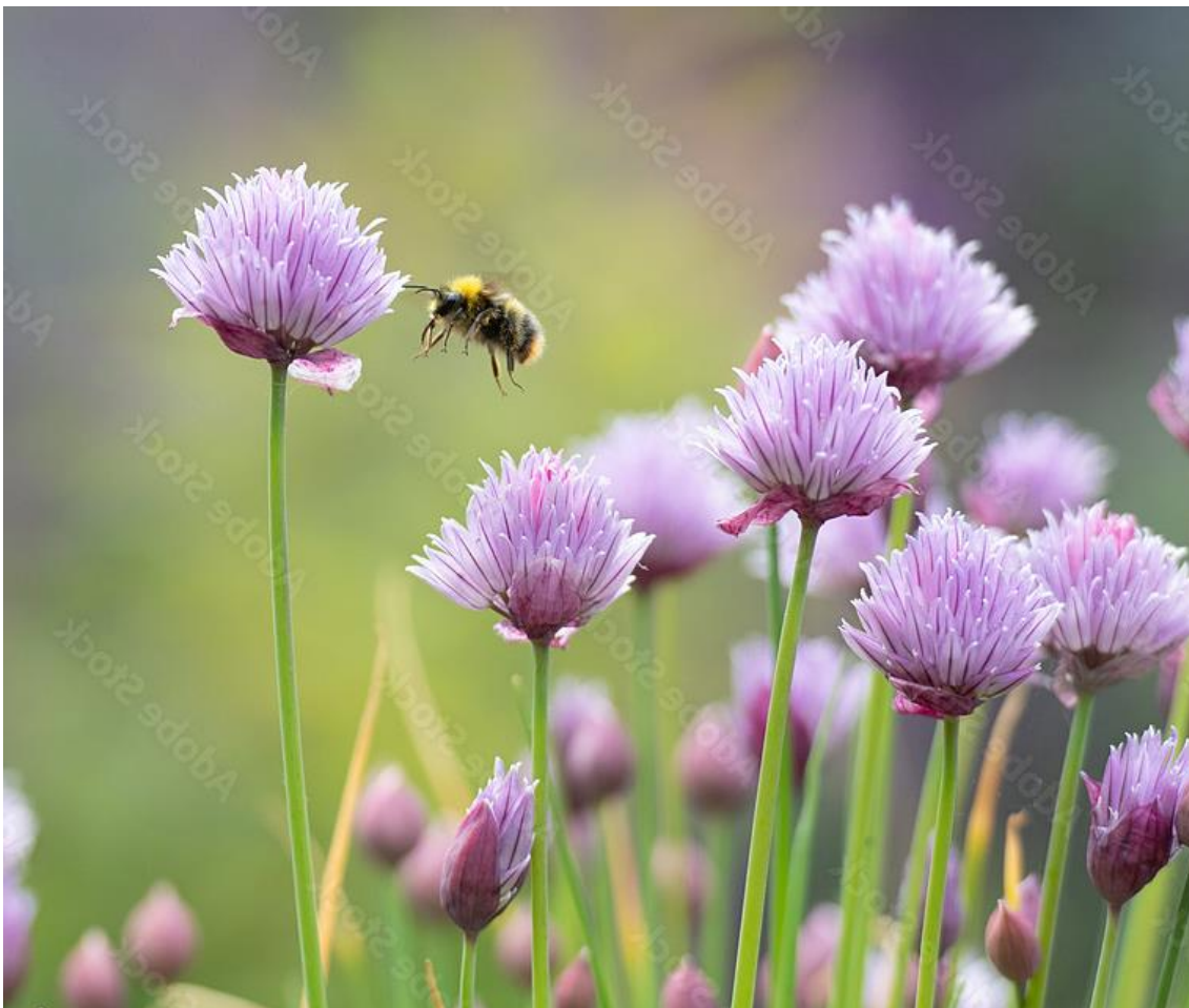
Bumblebee on chive flowers

Some suggestions are: Chives, Lavender, Rosemary, Mint, Thyme, Oregano and Sage. Have fun and enjoy!